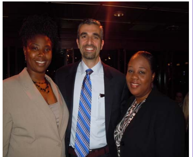
Leadership Congress 2011