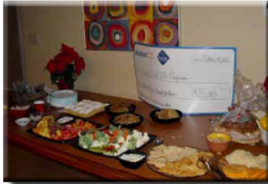
(Left) The Spread—Fruit, veggies, cheeses, and dessert table along with a blowup of the check for $265,000 from Walmart/Sams. Sandwiches were at another table.

Sandwiches, veggies, fruit, chips, soft drinks, and desserts were served. Everyone enjoyed the opportunity to relax and get to know better those who were present. There were approximately 30 in attendance. The Moseley's Galt House apartment, with a view of the Ohio River and plenty of room to sit and talk, was a perfect setting for the party.